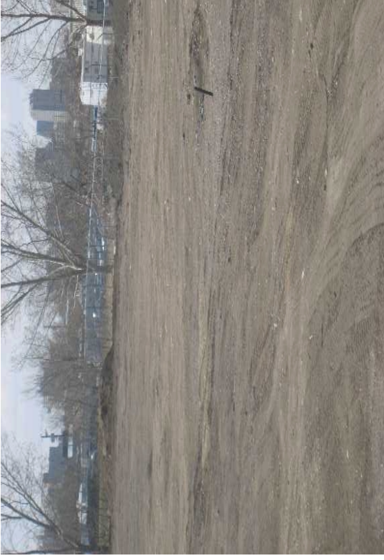
Looking southwest at vacant land that now occupies the former main entrance to the Regina Refinery.