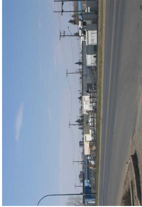
Looking south along Winnipeg Street from Staples parking lot at the back of the commercial strip.