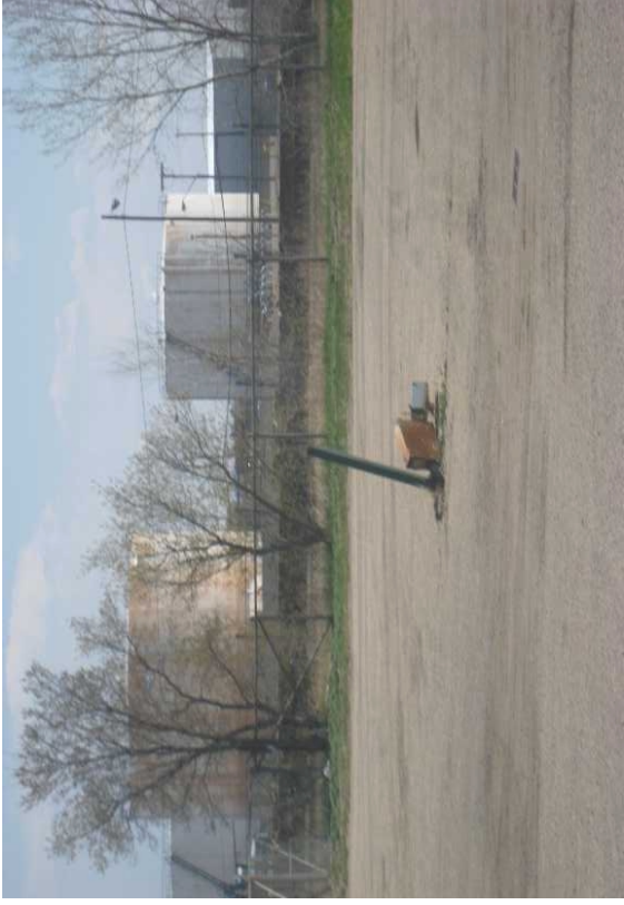
A pipe sticking out of the ground on south side of the Former Refinery looking east towards the Terminal.