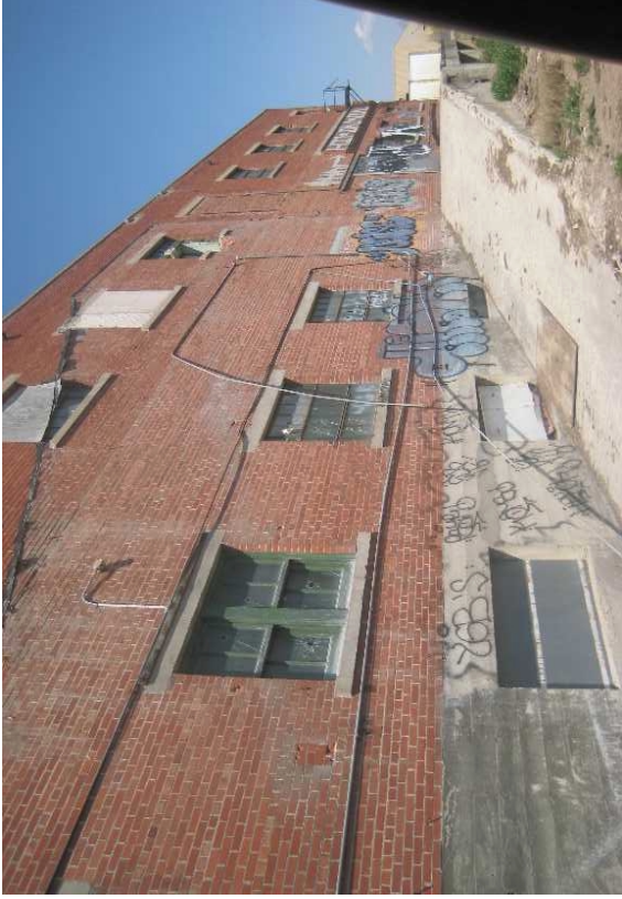
An abandoned Refinery warehouse building south of the Community First Computers and north of Adams Street in the southern portion of the Former Refinery.