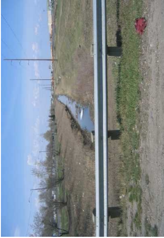
Ross Avenue drainage ditch south of the Former Refinery.