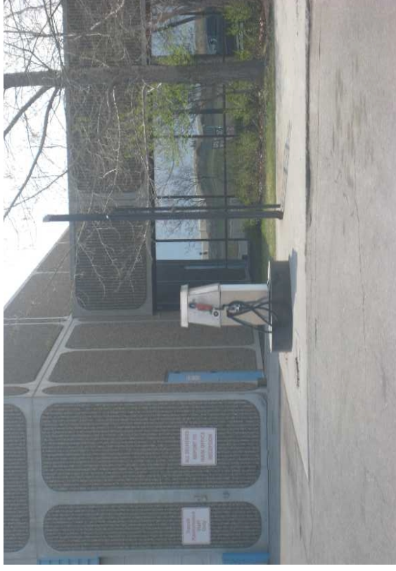
A pump island on northwest side of Regina Transit Operations.