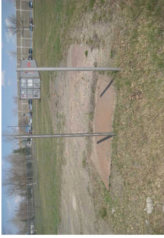
Structures between the Food Bank and the Regina Transit Operations Centre.