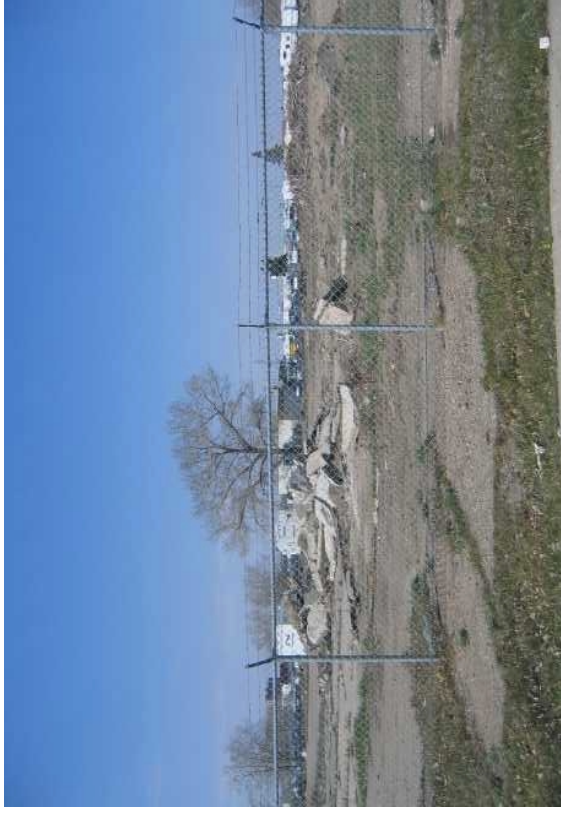
Looking west at 609 Adams Street immediately south of the Former Refinery office buildings.