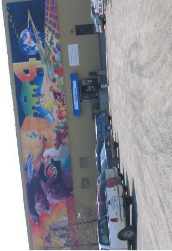
The Regina Food Bank at 445B Winnipeg Steet on the Former Refinery property.