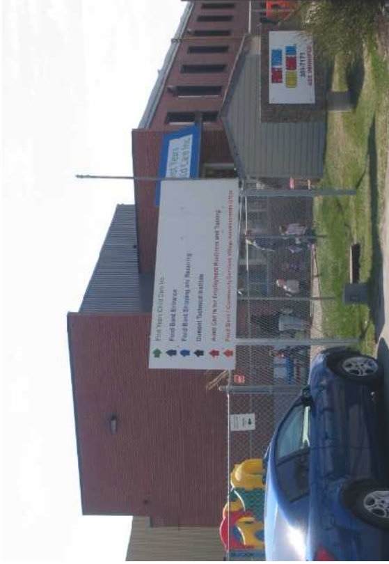
The current entrance to the Fomer Refinery site at 425 Winnipeg Street with the Former Refinery Technical Building now occupied with other businesses.