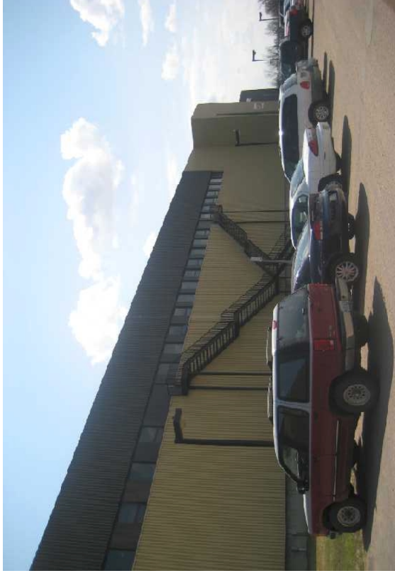
The west side of the Food Bank and the ICD building on the Former Refinery east of the former Technical building