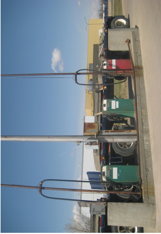
Looking west at the former pump island with the Food Bank in the background.