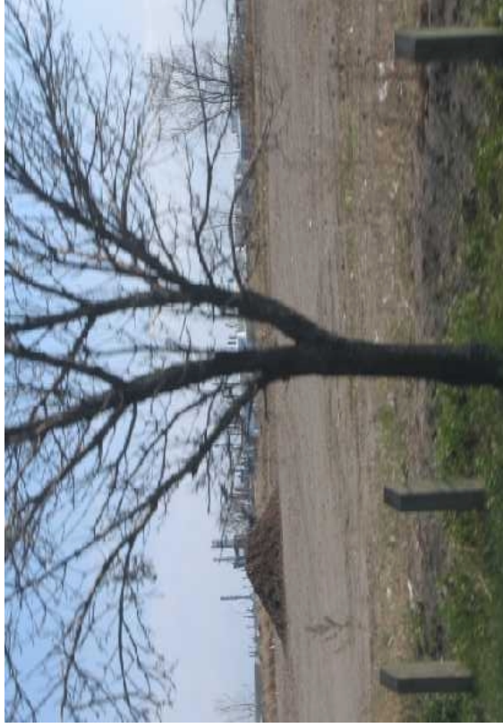
The northern portion of former Refinery now occupied by the City of Regina compost area.