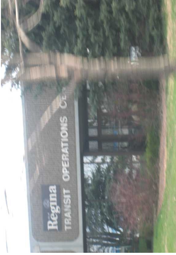
The Regina Transit Operations Centre located at 333 Winnipeg Street.