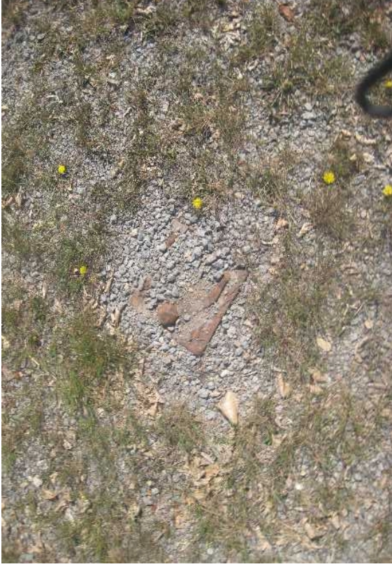
Potential buried object from the Former Refinery identified between the Food Bank and the Regina Transit Operations Centre.