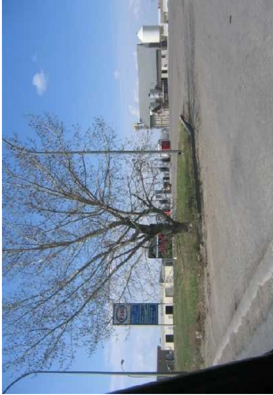
Esso Cardlock and fertilizer business at 530 McDonald Street on the east side of Terminal.