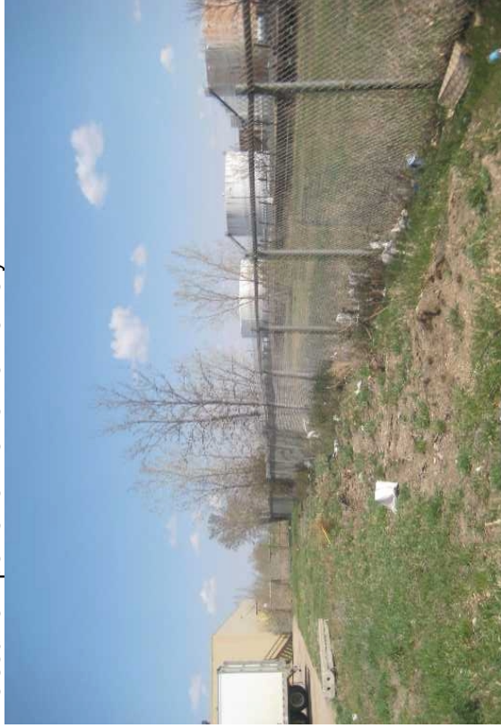
Looking north from the vacant former Refinery building along the CP rail line with the Terminal to the east.