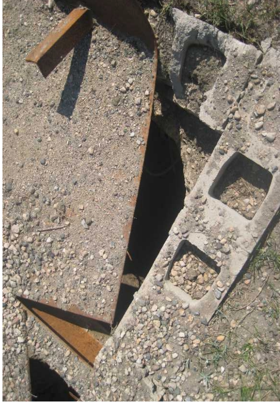
Building foundations on the vacant land north of the Food Bank and south of the Regina Transit Operations Centre.