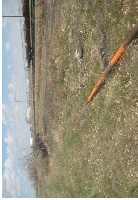
Abandoned pipeline exposed along the CP rail line east of the City compost area and west of the Terminal