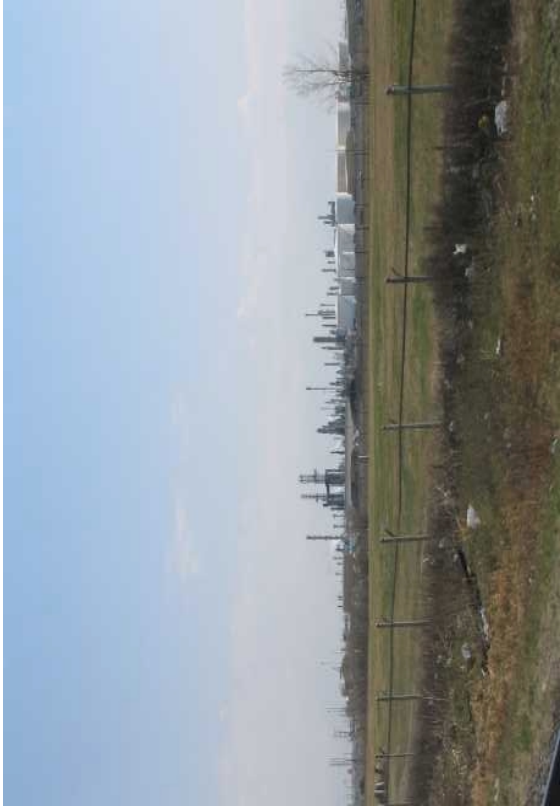
Enbridge facility on the northeast side of the Ring Road.