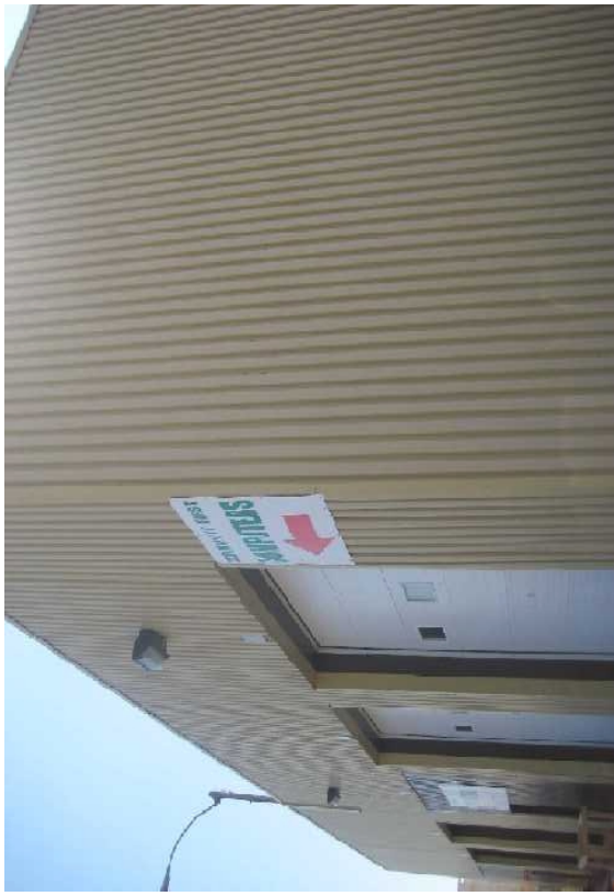
Community First Computers east of Food Bank on the Former Refinery along the CP rail line.