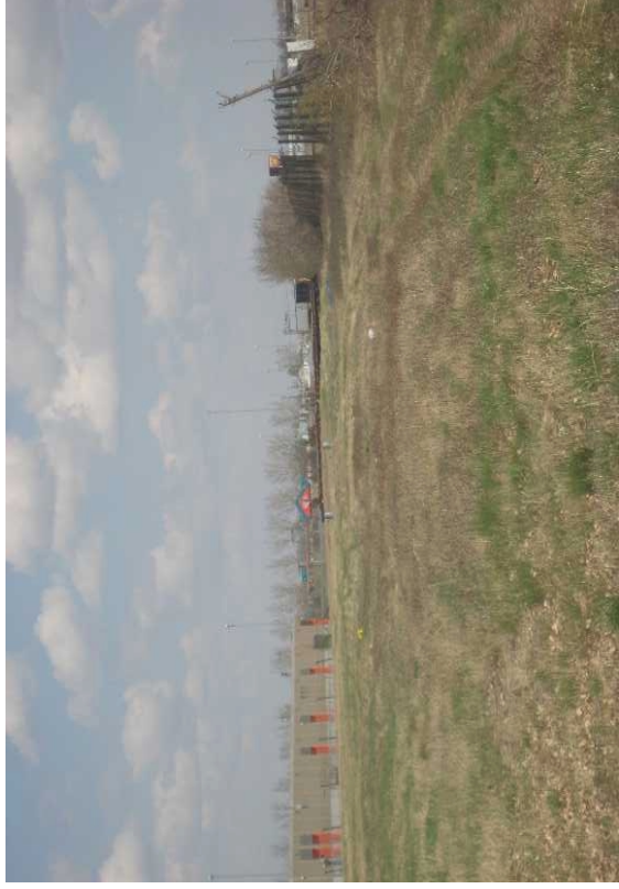
North of City compost area looking towards the Staples call centre.