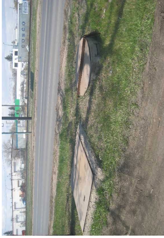
Underground facilities along Winnipeg Street adjacent to the southern part of the Former Refinery.