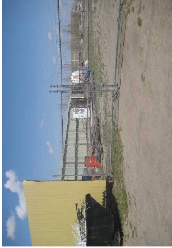
The Community First Computers storage area on the Former Refinery.