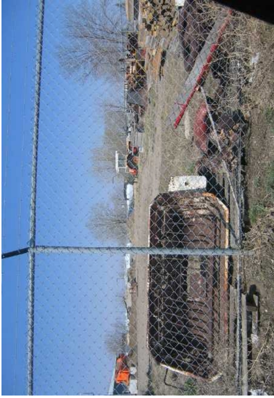
682 Adams Street along west side of Adams Street south of the Former Refinery.