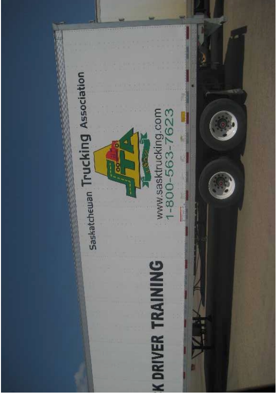
A trucking operation occupying a paved area of the southern part of the Former Refinery just north of the abandoned warehouse building.