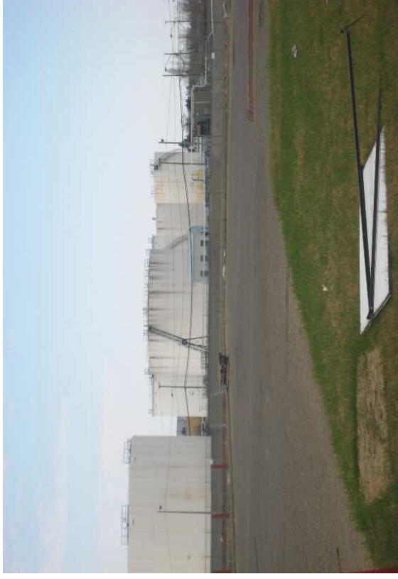
The Imperial Oil Distribution Terminal at 550 McDonald Street.