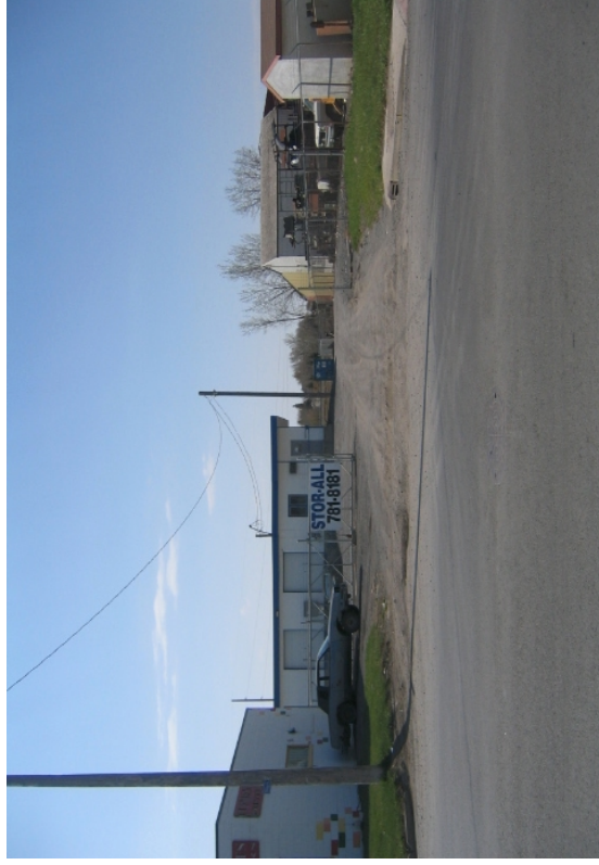
Businesses along the south side of 1st Avenue, south of the Former Refinery.