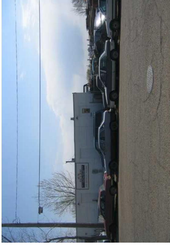
Looking east at 607 Adams Street immediately south of the Former Refinery