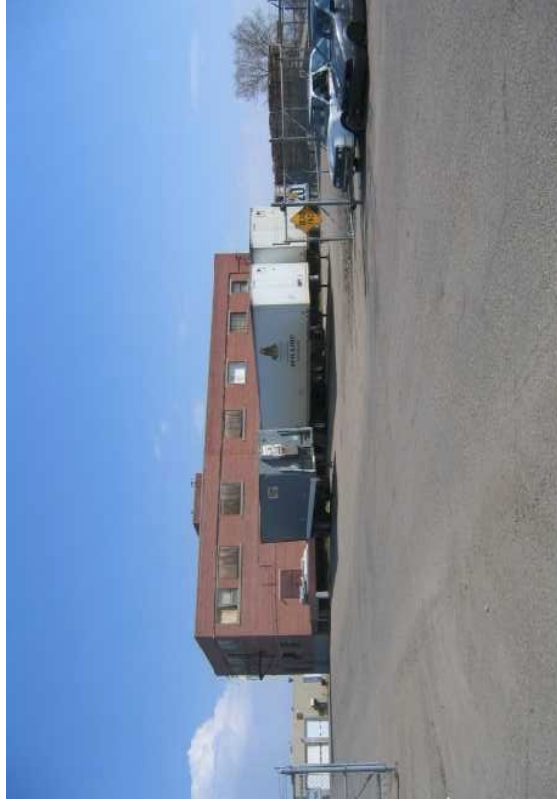
The former south gate to the Refinery at Adams Street. A Former Refinery building is present in the centre of the photo.