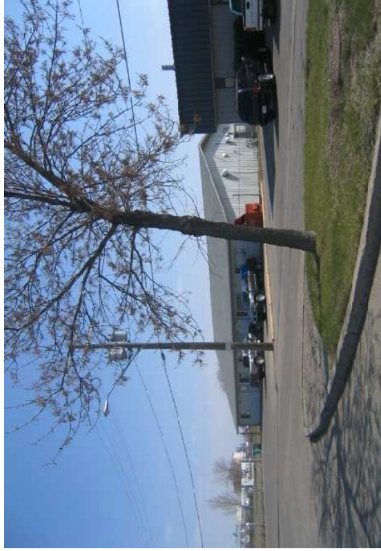
Businesses along the east side of Adams Street, south of the Former Refinery