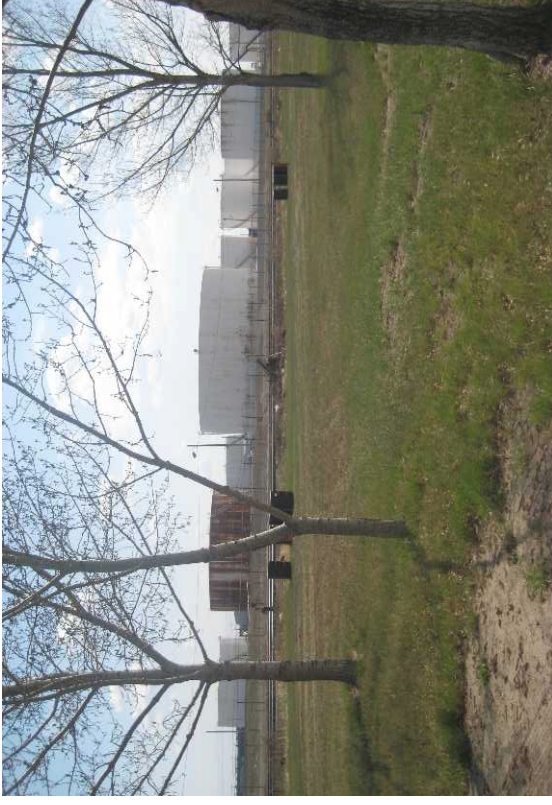
Looking east at Terminal from Regina Transit building. Two groups of soil barrels from drill cuttings are present along the CP rail line between the properties.