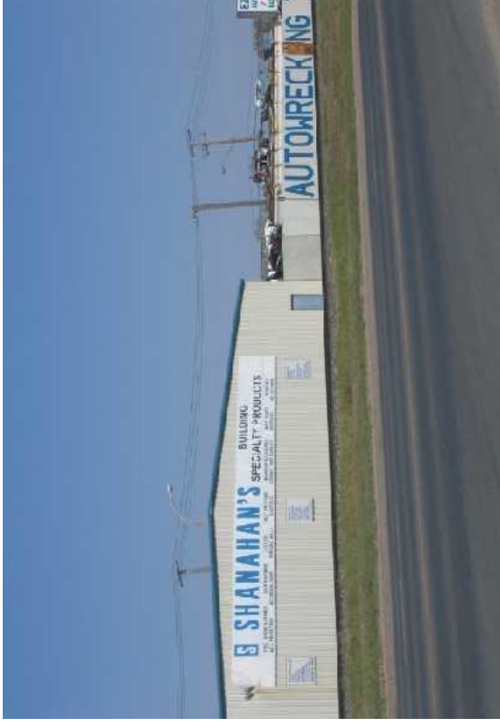
Businesses along the west side of Winnipeg Street on the west side of the CN rail line.