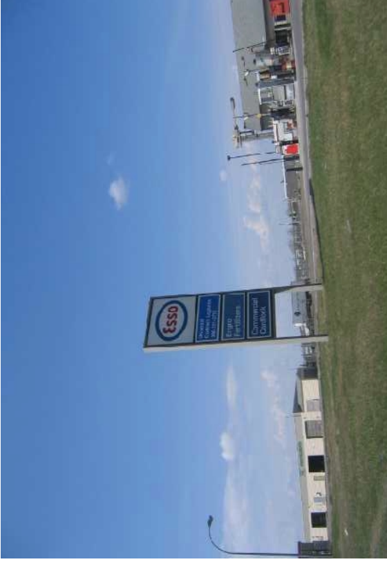
Esso cardlock at 530 McDonald Street.