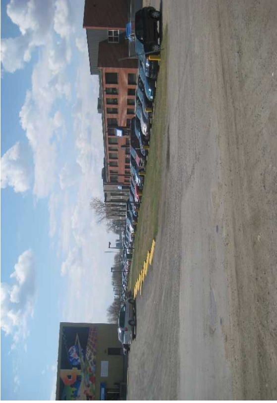
Looking south from the parking area at the west corner of the Food Bank and east side of the former Technical building.