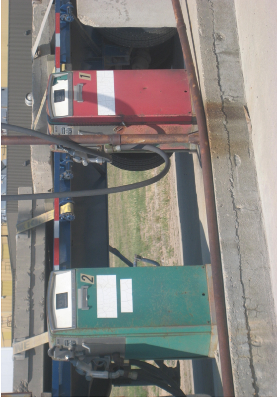
Close up of gas pumps on the former pump island.