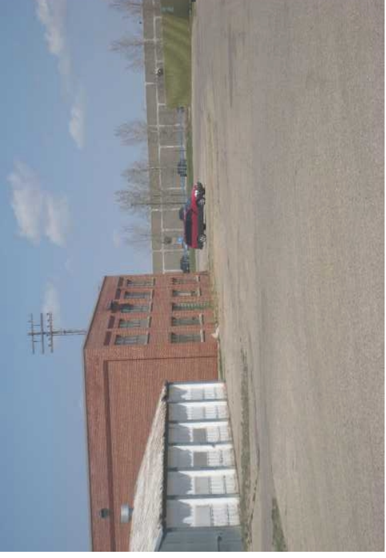
Former Refinery buildings present on the site east of the Food Bank.