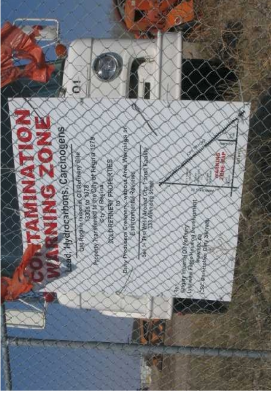
Sign on 682 Adams Street south of the Former Refinery.