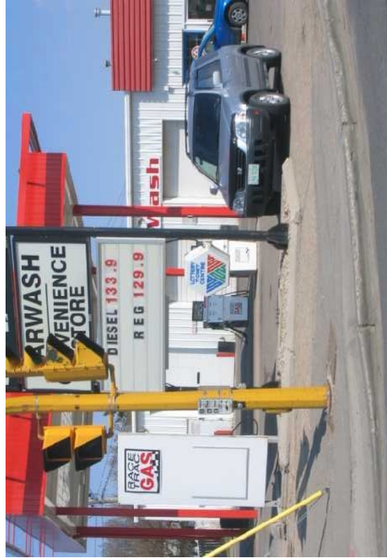
Gas station on the north end of Winnipeg, outside of the study area.