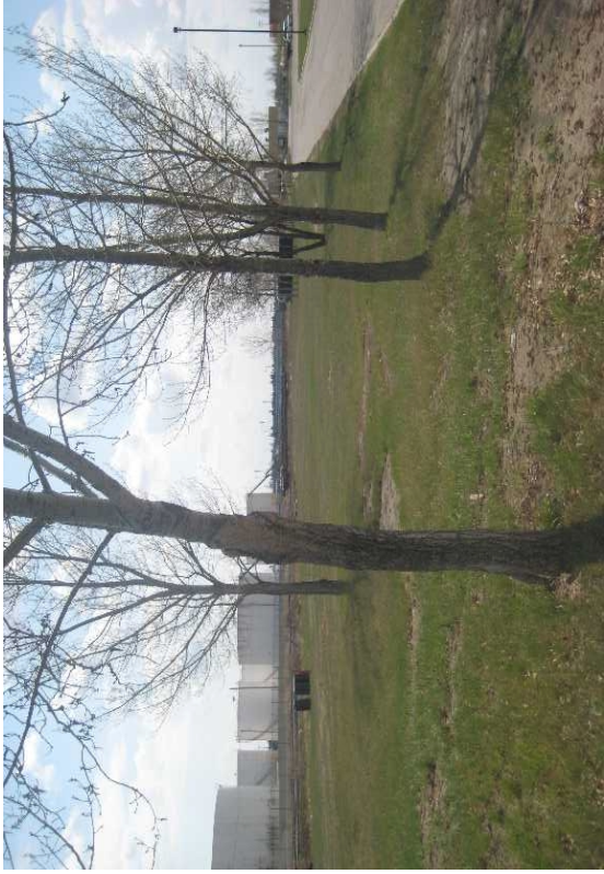
Looking south along east side of Regina Transit building with the Terminal in the left side of the photo.