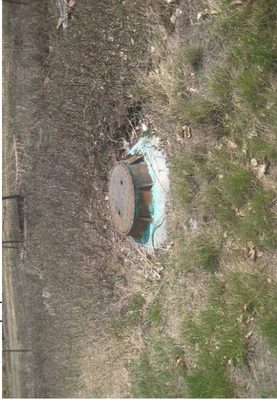
A manhole or hatch to an underground storage tank along the west side of CP rail line east of the City compost area and west of the Terminal.