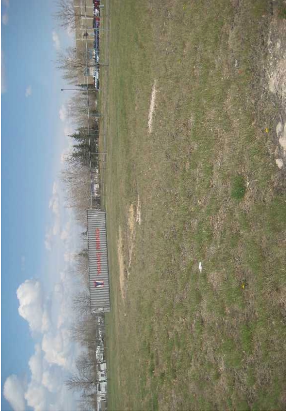
Vacant land north of the Food Bank looking northwest towards the Regina Transit Operations Centre.